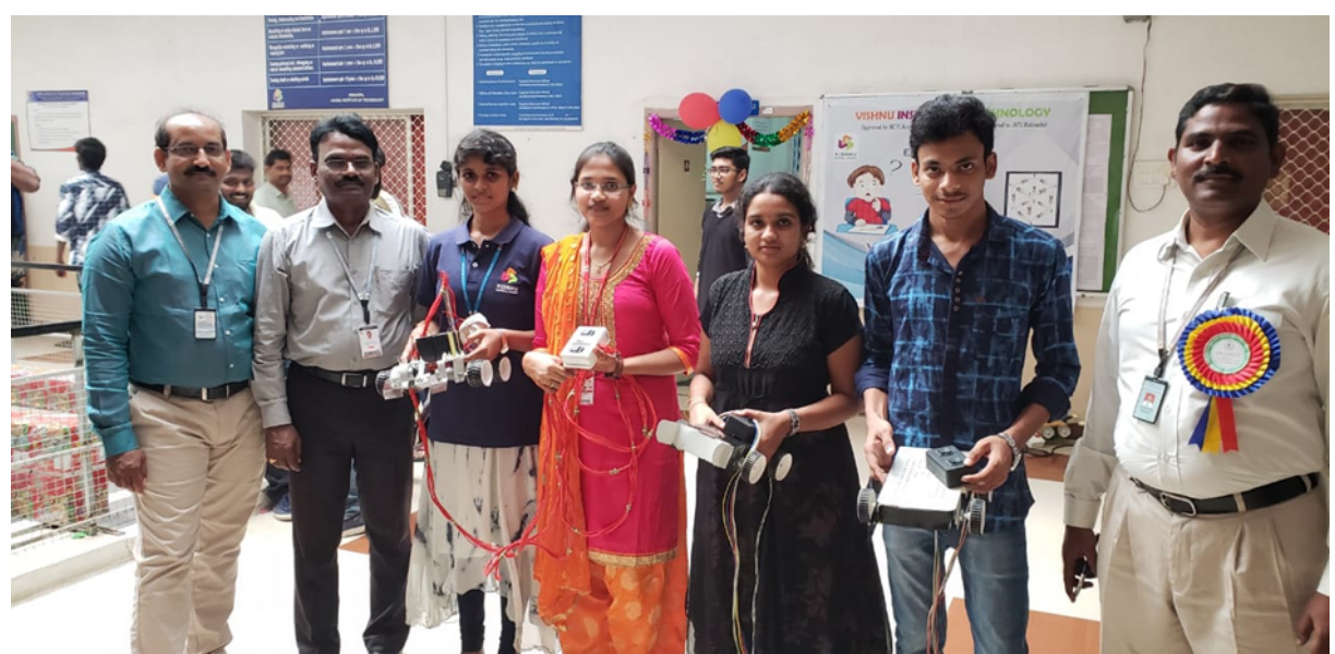
The winning team