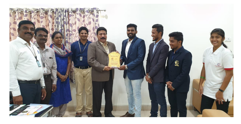
VALIANT - 2018 : DRONE VOYAGE

Valiant is a prestigious fest organized by the Vishnu institute of technology It is a feast for students as well as their skills and also an energetic moment.