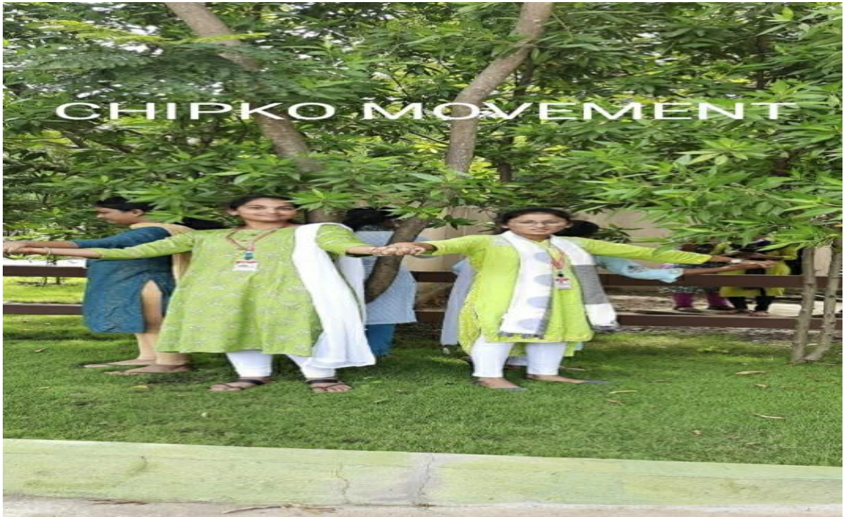
Awareness program on CHIPKO movement