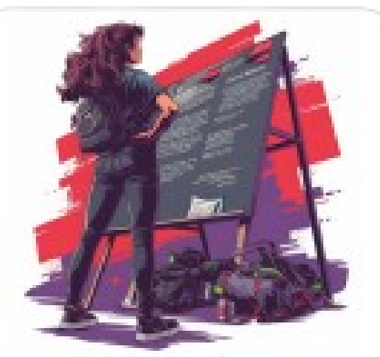
Self-growth through personal vision-boards & goal-setting workshops