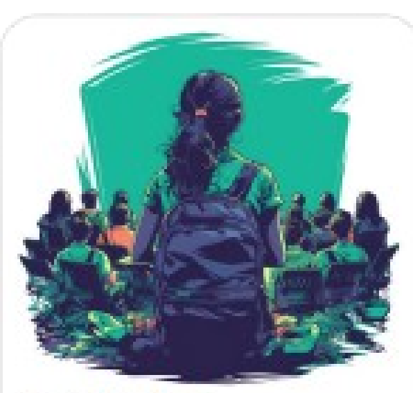
Student-led Recap Sessions