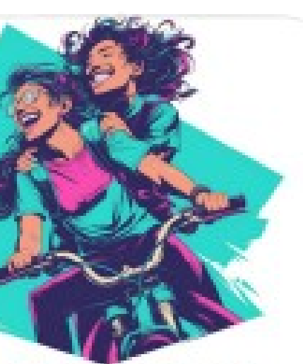
Finding friends through shared Extra-Curricular