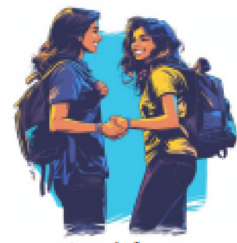
Peer-network for Career-Fairs, Job searches, etc.