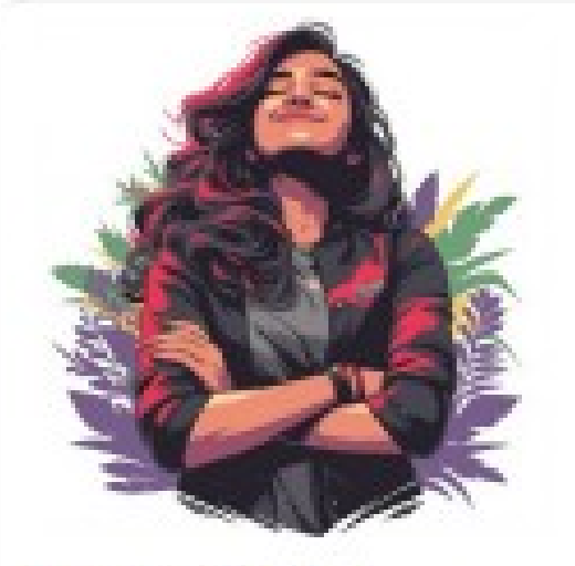
Prompt-based Reflective Sessions for self-awareness & life-skills