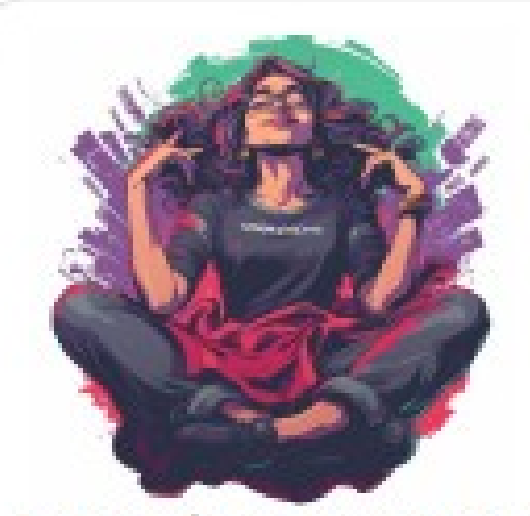
Personality assessments and peer feedback sessions