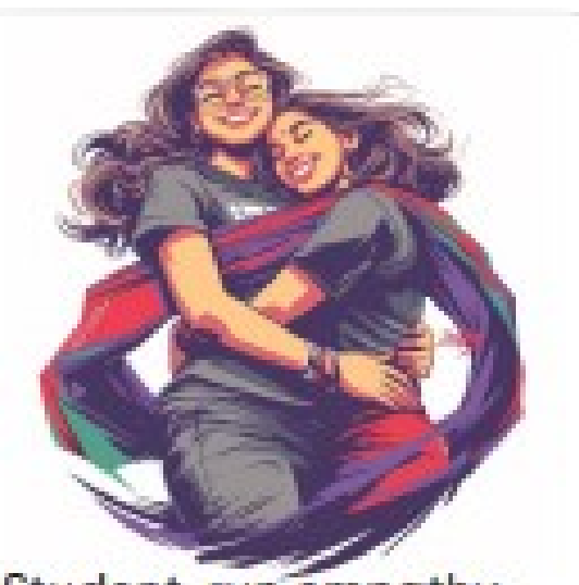
Student-run empathy circle (sharing and problem-solving)