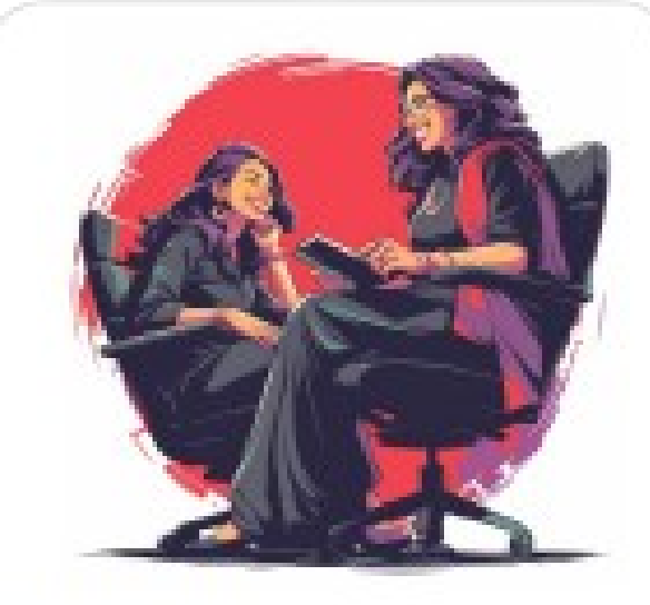
Access to one-on-one counselling