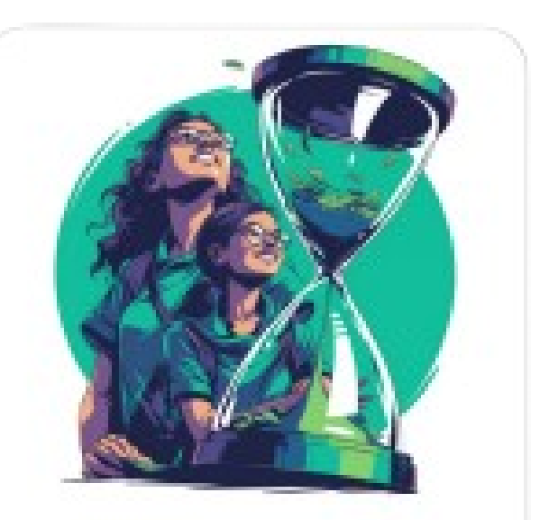
Managing Finance and Time