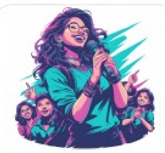
Peer Mentoring and Reflection Groups